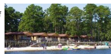
Beachfront at Sam Rayburn Marina Resort

Registered anglers will get more details soon!