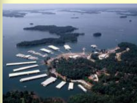
Portman Shoals Marina, South Carolia

“Big Sam” Sponsors Jasper Area Chamber of Commerce, The Crazy Horse Ranch, Jasper County Sherriff’s Department, SAVE PHACE, Backwater Custom Baits, Santone Lures and Predator Spinnerbaits