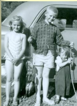
She is the one on the left side of the photo along side her brother and little sister!